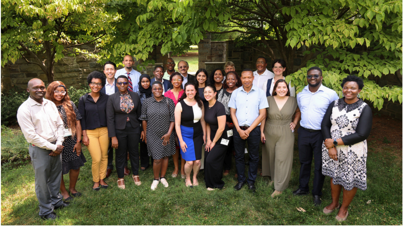
2024-2025 (Y8) cohort, HBNU alumni, HBNU PIs, and staff at NIH orientation